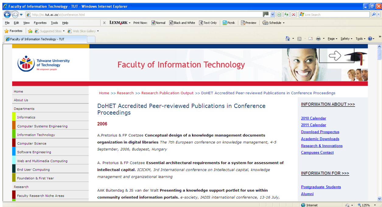
Figure 2. New ICT Faculty webpage to enhance information dissemination (Dehinbo & Ojo, 2011).